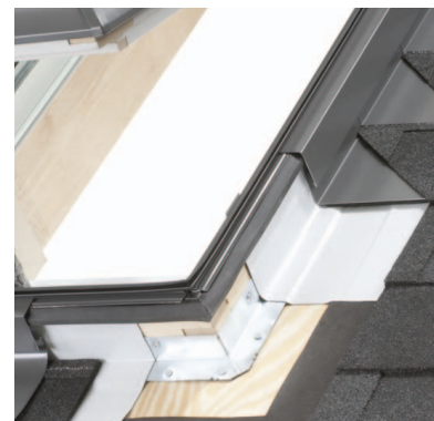
EDL flashing for flat roofing material

EDW flashing is used for Roof Windows installed into tile or corrugated (or similar) roofing. Concrete or terracotta tiles with standard profiles can be used. Custom orb profile metal roofing can be used.